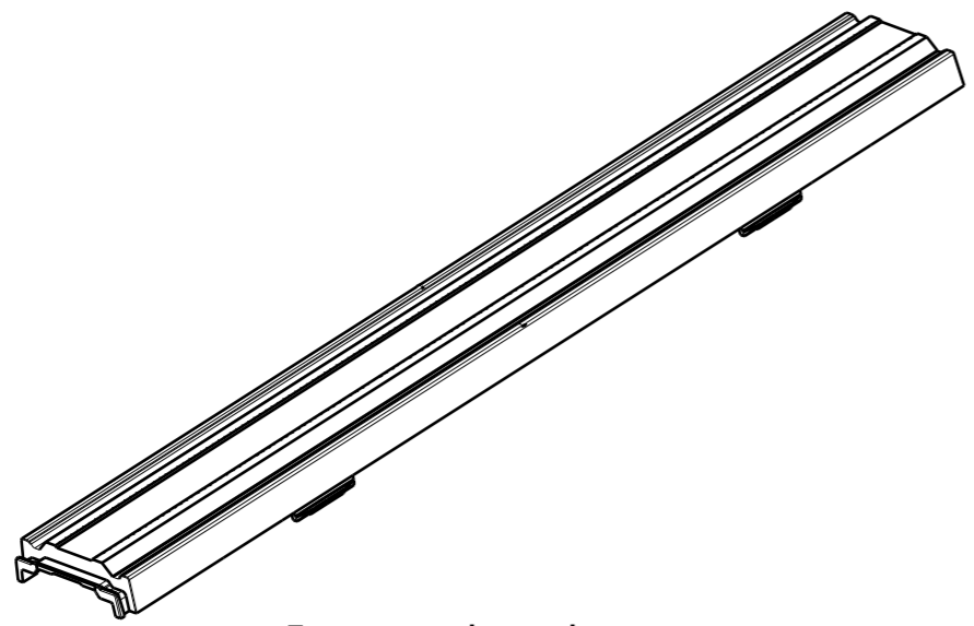
Isometric view Scale: 1:2